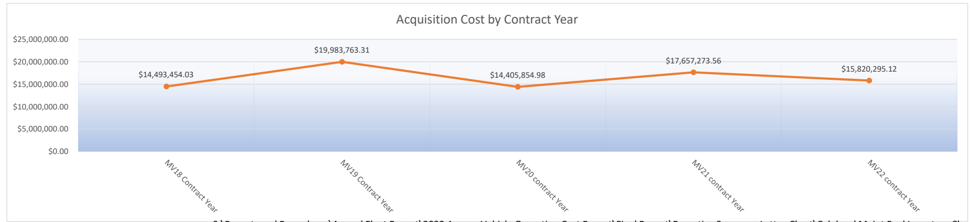
S:\Reports and Procedures\Annual Fleet Report\2022 Agency Vehicle Operation Cost Report\Final Report\Executive Summary Letter-Chart\Cab level Maint Fuel Inventory Chart Report Ver 6